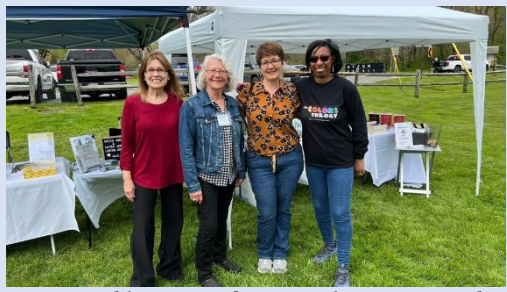
04/23: Lockhouse Craft Beer and Wine Festival

o5/13: 18th Annual Cavalcade of Authors Spring Fling - Romance Panelist