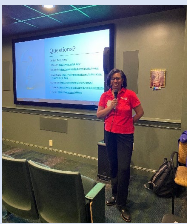
06/16: Brightview Avondell – Speaker Presentation

07/29-31: Writer's Digest Conference -Attendee