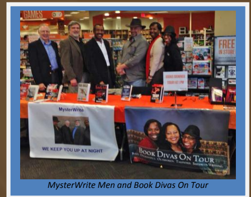
MysterWrite Men and Book Divas On Tour