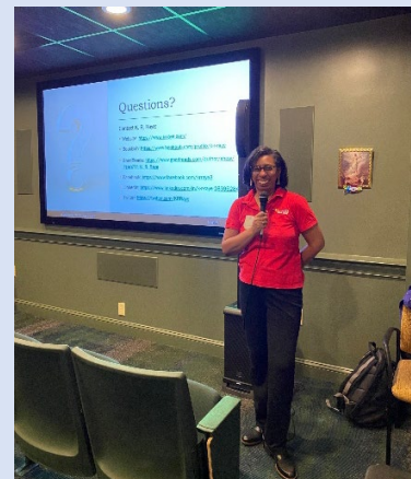
06/16: Brightview Avondell – Speaker Presentation

07/29-31: Writer's Digest Conference - Attendee